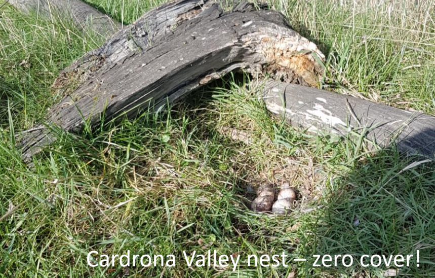
Cardrona Valley nest – zero cover!